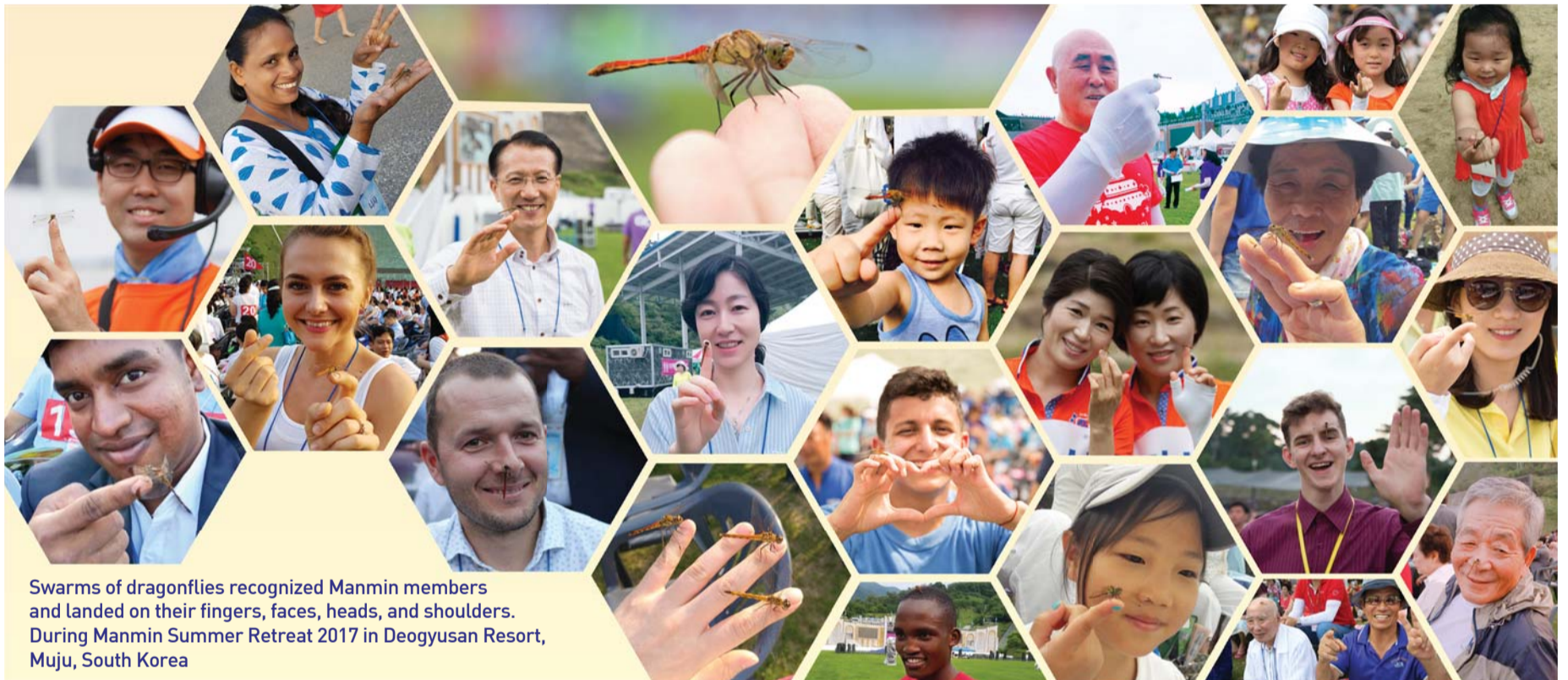
Swarms of dragonflies recognized Manmin members and landed on their fingers, faces, heads, and shoulders. During Manmin Summer Retreat 2017 in Deogyusan Resort, Muju, South Korea