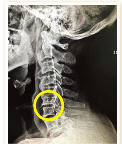
Cervical vertebra 5 & 6 He had forward head posture but he was healed. Now he had no problem moving his neck.

I give all thanks and glory to God who gave answers to all my problems all at once.