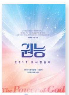
Textbook for Teachers' Conference 2017