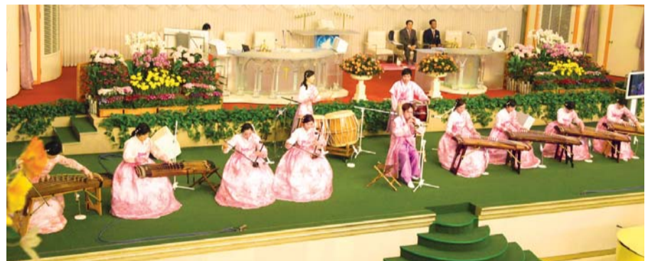
Serem Korean Traditional Music Team offering up special performance

I give thanks to God who gave me this great blessing as well as saved me who was on the way to death and gave me hope for New Jerusalem. Hallelujah!