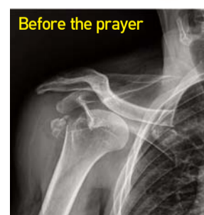
Before the prayer

when he came back to the church from the mountain prayer house. I felt cool and comfortable during the prayer. In the evening, I took off the protective support and came to live normally. Hallelujah!