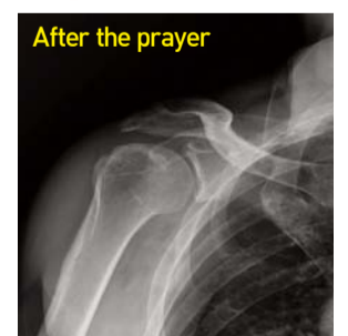
After the prayer

Due to external injury, the right shoulder joint was dislocated and greater tuberosity of humerus was broken into small pieces.