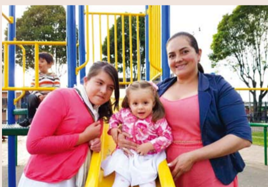
Before the prayer