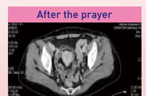
The stone is not seen