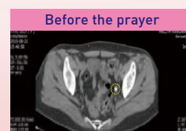
The urinary stone, 1.3cm in size in left ureter

I had suffered from the pain caused by a urinary stone which was 1.3cm in size. I was told that it would be hard to be removed without a surgery because of its size. But it vanished through the power of God. I give all thanks and glory to the living God who showed this amazing work to me.