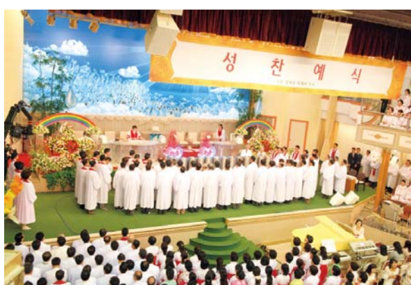
Easter Sunday Holy Communion 2015

Easter is one of the three major Christian feasts, and 'resurrection' means that even dead people who were saved will be transformed into resurrected body when the Lord comes again and live forever (Refer to page 3).