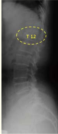
▲ Before the prayer 12th thoracic vertebra compression fracture, her spine bent forward

The doctor told me that it would be worse after the surgery and I might be crippled. I was not able to cover the cost of the surgery, so I had to return home. Later I had severe pain in my back and abdomen as though needles were poking me. So, I had to wear the waist supporter. When I worked a little, retroperitoneum filled my abdomen and I could do nothing. My daughter, who was watching me living in pain, urged me to go to South Korea and have surgery.