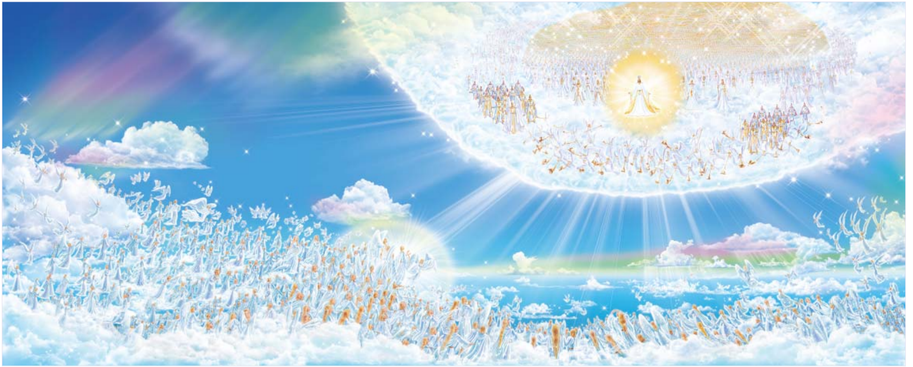
The Lord who comes in the air and the believers who put on the resurrected body