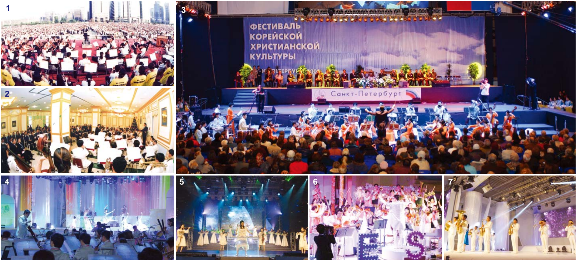
Nissi Orchestra is made up of Manmin members. On February 28, 2016 they celebrated their 24th anniversary and gave glory to God with special renditions of two songs "Heavenly Glory" and "Our Praise 2". The orchestra was organized on March 1, 1992 and since then it has been contributing to the spreading of the gospel and the development of Christian culture (Photo 1, Peaceful Re-unification Jubilee Convention celebrating 50th anniversary of Korea's independence; Photo 2, National Annual Breakfast Prayer and Korea-Russia Goodwill Concert; Photo 3, Russia Miracle Crusade 2003; and Photos 4 through 7, events of the church).