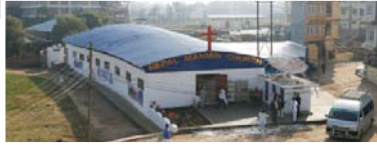
Nepal Manmin Church (right top) was protected from the 2015 Nepal Earthquake and blessed to build a new sanctuary.

On April 25 2015, a major earthquake with 7.8 magnitude and its aftershocks hit Nepal. But Nepal Manmin Church and its 196 branch and associate churches were all protected (currently it has 208 branch and associate churches as of December 2015). On November 14, 2015, the church had its sanctuary relocation service and 10th Anniversary Service. The members offered up their thankful hearts to God who protected them beyond human power in the disaster and blessed them in spirit and body.