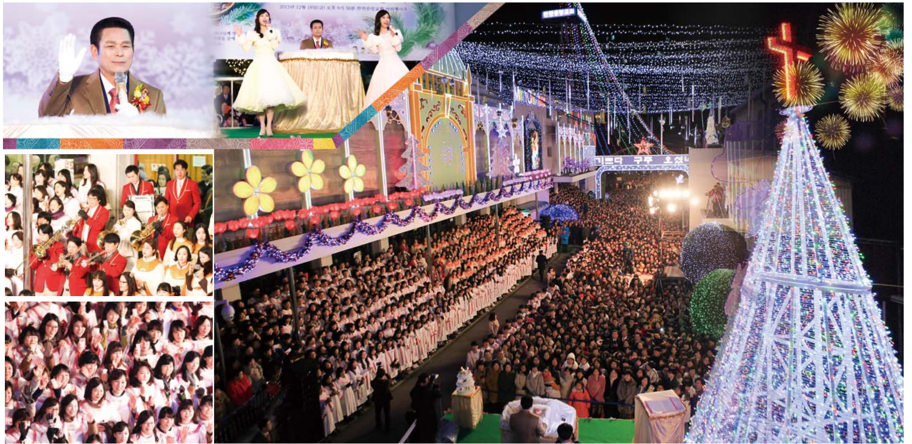
The Christmas Lighting Ceremony 2015 was held at 9:50 P.M. on December 18, 2015. The 2015 Christmas ornament's theme was "the Festival of Flowers" in New Jerusalem. The ceremony was broadcast live via GCN.