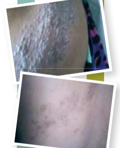
After the prayer