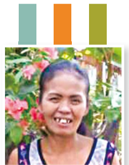
Before the prayer