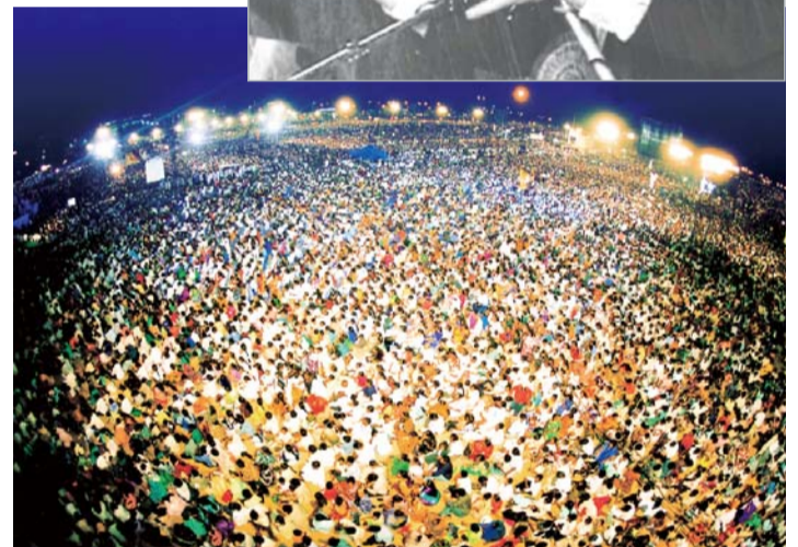
India United Crusade 2002 was attended by a total of more than three million people. During the period of the crusade, severe drought was relieved. Many people were healed and converted to Christianity.