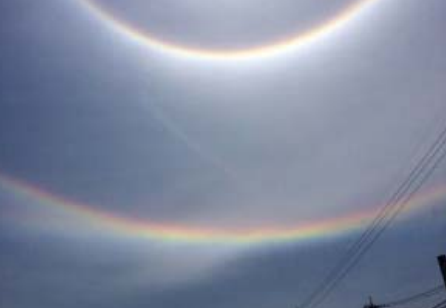
May 22, 2014 Tokyo Manmin Church, Japan