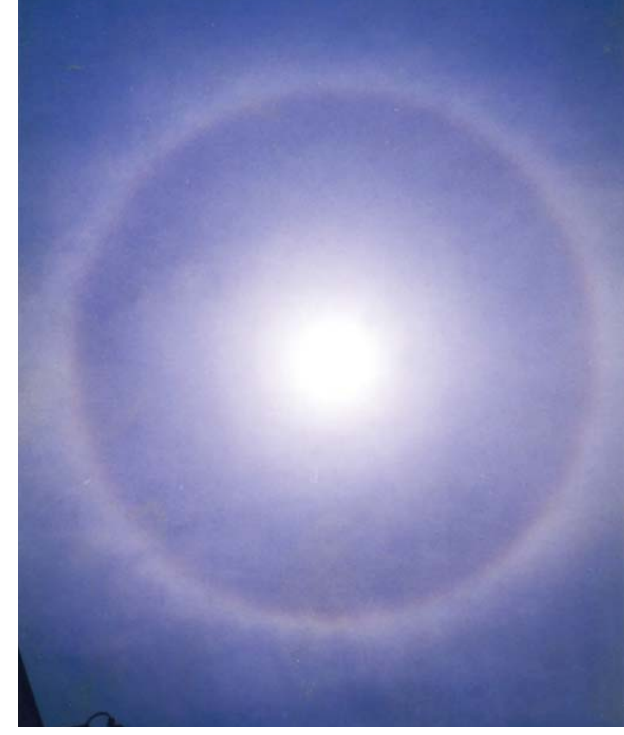
May 15, 1998 Manmin Central Church

A rainbow refers to a seven-colored circular arc that appears opposite to the sun when water drops in the air are reflected and refracted after it rains (Genesis 9:13). However, extraordinary rainbows are often witnessed in the sunny weather by the members of Manmin Central Church.