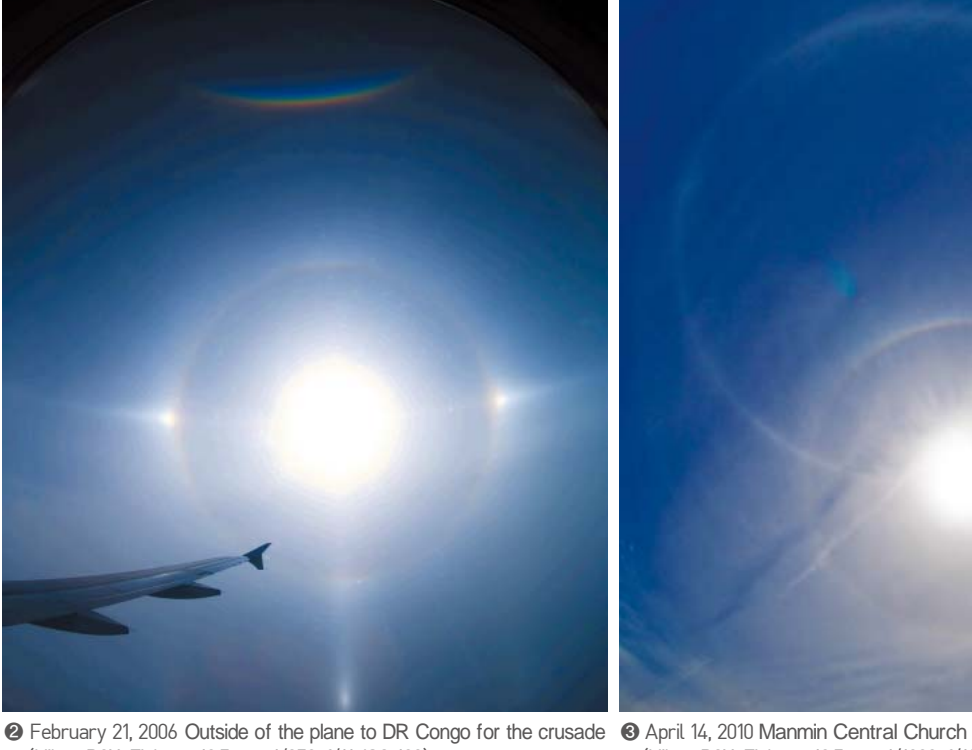
(Nikon D2X, Fisheye 10.5mm, 1/250, f/11, ISO 100)

Revelation 4:3 states, "And He who was sitting