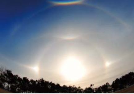
(6) January 27, 2011 Muan Manmin Church (Nikon D80, Fisheye 10.5mm, 1/500, f/11, ISO 200)