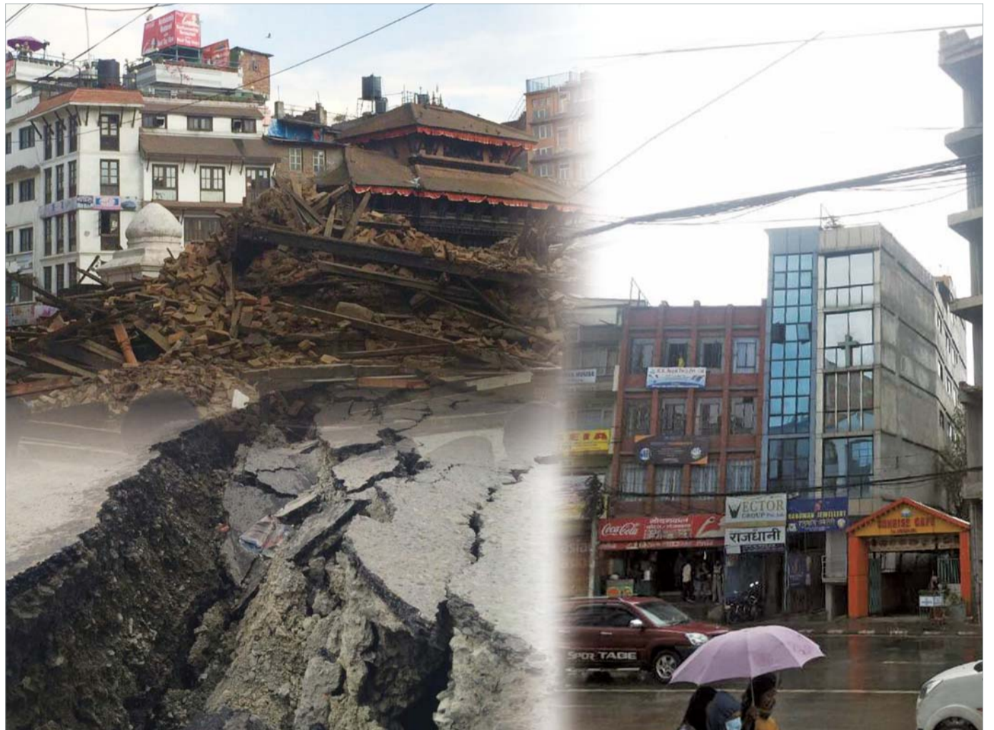
The major earthquake in Nepal claimed the lives of thousands of people. Let's pray that there is no more damage and the people won't suffer from further trauma. In addition, let's become God's blessed children who are always protected by Him and give glory to Him.

On July 15, 2014, it was night-time in the Philippines, when a similar