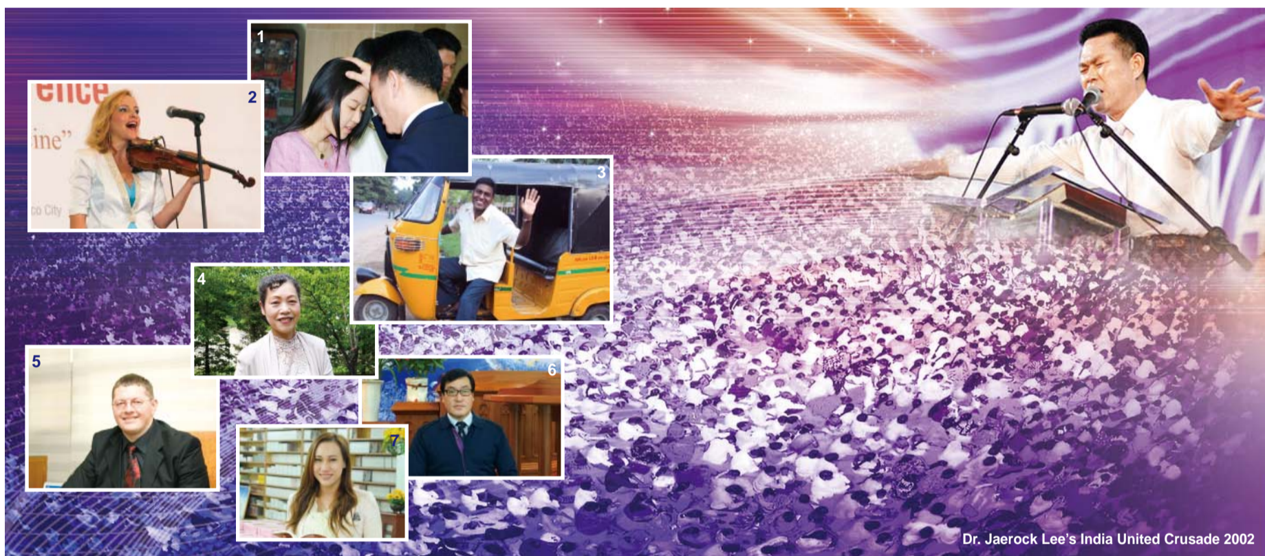
Dr. Jaerock Lee's India United Crusade 2002

“There appeared tongues as of fire distributing themselves, and they rested on each one of them”