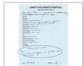
No lymphoma in bone marrow examination