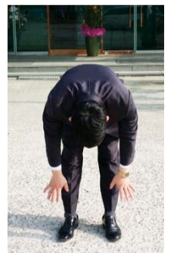
Now he can bend and straighten his body.