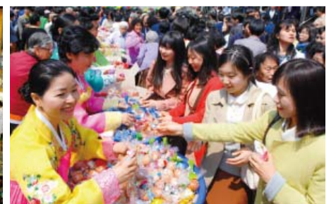
The resurrection of the Lord adds more hope for Heaven to believers. Easter is the day when believers deliver the good news of the Lord's resurrection (Photos: 2014 Easter Service and Holy Communion, the church members sharing eggs with joy).