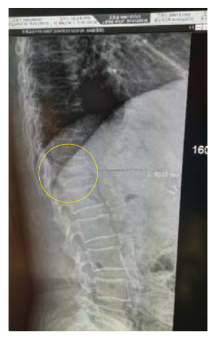
vertebrae: 12th one with compression fracture

It is said that in the case of compression fracture of thoracic vertebrae, improvement can be seen in six months at the earliest though it is treated with medicine, physical therapy, or brace-wearing. But my pain was gone, and in a few days, I came to walk normally. God's power is really amazing! I give all thanks and glory to God.