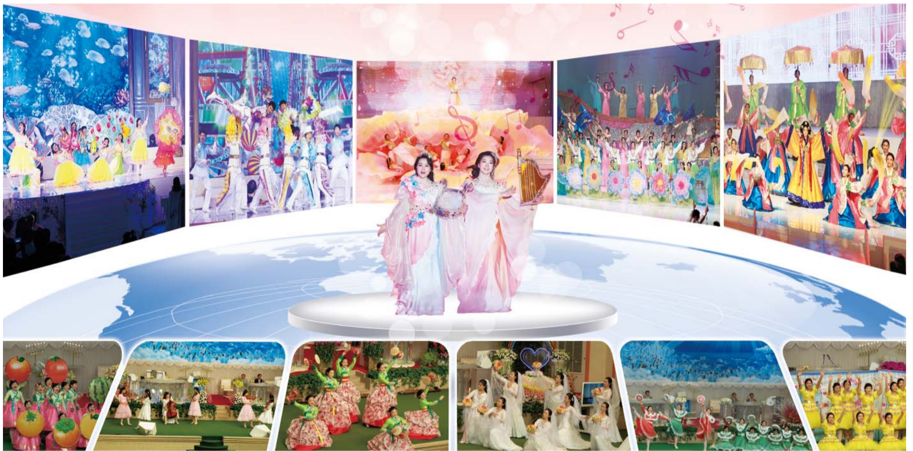
Manmin Central Church's Performing Arts Committee has given inspirational performances for many church occasions including overseas crusades, pastors' seminars, handkerchief healing meetings and Easter, Church's Anniversary, and Christmas and opened the new era of Christian performing culture (Photos: Sweet Rain Chorus, Miracle Junior, Manmin Korean Traditional Music Team, Beautiful Aroma Dance Team, Aurora Dance Team, Clear Sound Chorus).

Performing Arts Committee cultivates young performers