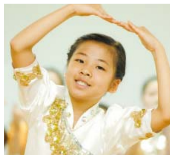
The pain caused by atopic dermatitis is terrible. But when they relied on God, He gave them whiter and cleaner skin and sincere faith as gifts.