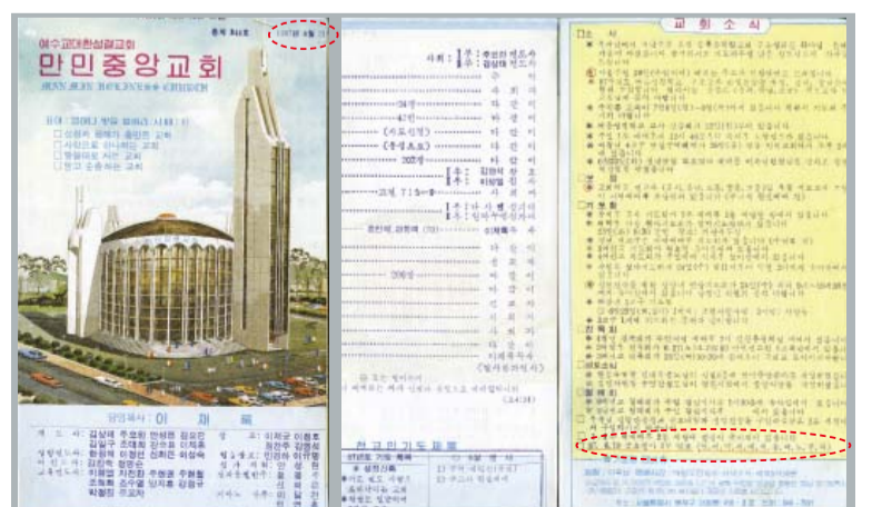
Manmin Central Church's weekly bulletin's cover and contents, published on June 21, 1987 shows the prophecy of 6/29 Declaration.