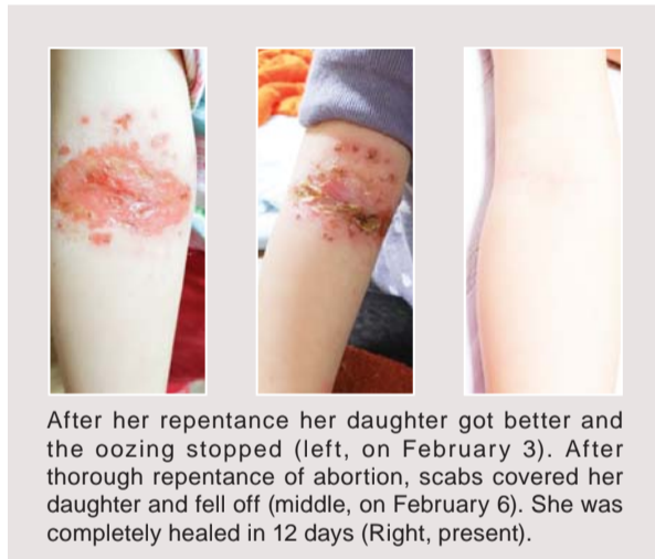
After her repentance her daughter got better and the oozing stopped (left, on February 3). After thorough repentance of abortion, scabs covered her daughter and fell off (middle, on February 6). She was completely healed in 12 days (Right, present).