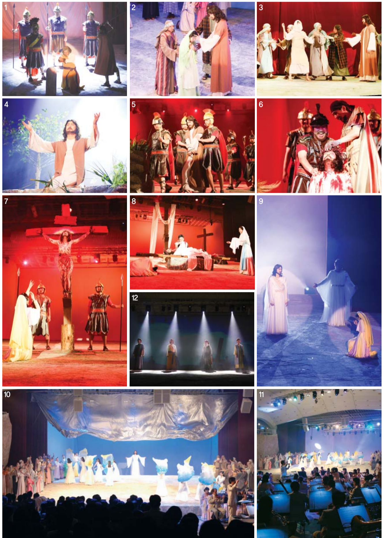
In order to fulfill His duty as the Savior, Jesus came to the earth, preached the gospel of the kingdom of heaven, healed every kind of diseases and all infirmities, died on the cross, overcame death, resurrected, and ascended into heaven. Picture 1: Apostle Paul, being beheaded, Pics 2 & 3: Jesus opening a blind man's eyes and reviving the dead Lazarus, Pic. 4: Jesus' prayer on Gethsemane, Pics. 5 & 6: Jesus suffering from soldiers and wearing a thorny crown, Pic. 7: Jesus' Crucifixion, Pic. 8: Joseph from Arimathea shrouding the body of the dead Jesus, Pics. 9-11: The Lord's resurrection and ascension, Pic. 12: The disciples going the way of the Lord

The church members inside and outside of Korea were able to watch together via live broadcast by GCN ( www.gcntv.org ). They said they felt the Lord's ardent love from their hearts and made up their minds to live like the apostles who took the way of martyrs. They are expected to preach the holiness gospel and God's powerful works to all people of all nations with the shepherd at this end time.