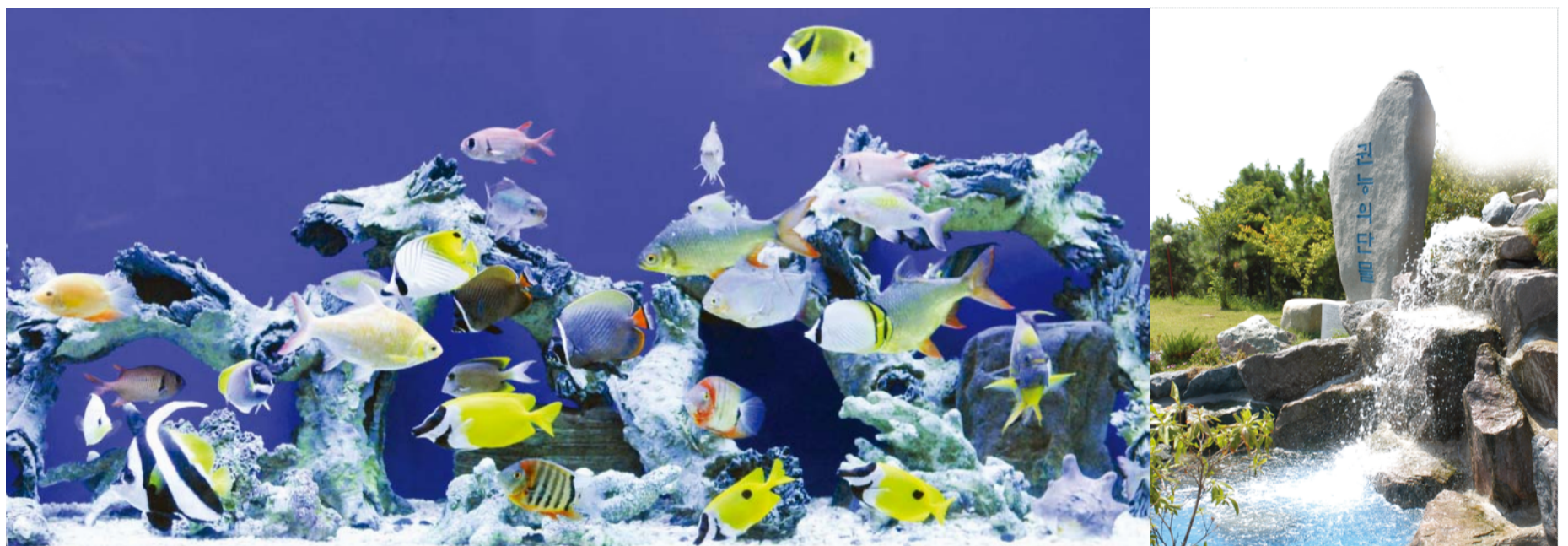
Thousands years ago, freshwater fish and seawater fish lived together during the flood of Noah. The mysterious work in the Bible has re-occurred and can be seen at the Muan Sweet Water Aquarium. (First line, left—Dr. Jaerock Lee praying when the aquarium opened in 2007)

Manmin Central Church visitors have a must-see. It is the Muan Sweet Water Aquarium. Countless people visit here every year and witness a mysterious location where they can see seawater fish and freshwater fish co-existing in the same tanks.