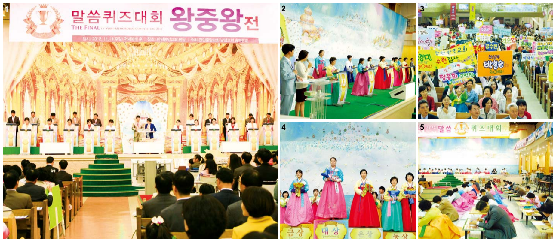
All the prize winners of the 12 contests competed in ‘The Best of the Best’ Bible Quiz Contest in November 2012 (Photo 1). Just like them, the 13 th contest was also full of the church members’ fervor for the Word of God. Photo 2: The quick pop quiz in the final round Photo 3: The cheering for the contestants Photo 4: Award Ceremony Photo 5: The contestants answering the questions in a written form

The Bible Quiz Contest contributing to the members arming themselves with the Word