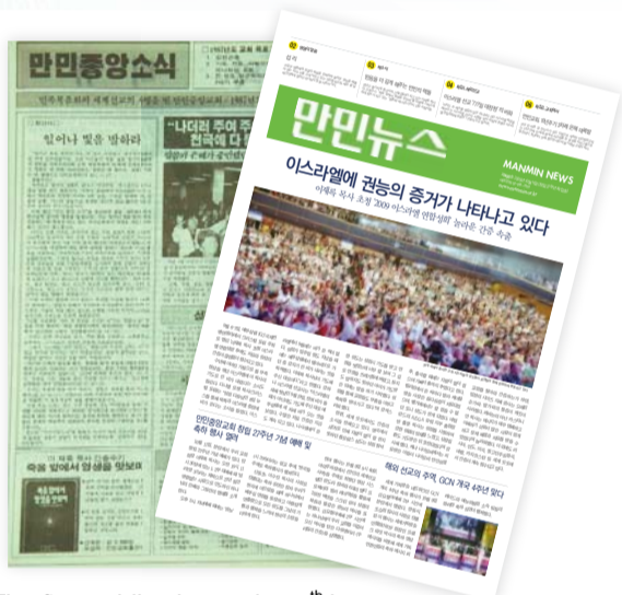
The first publication and 400 th issue

Manmin News celebrated its 600 th anniversary of spreading the power of God the Creator, the gospel of Jesus Christ, and the works of the Spirit to all the parts of the earth and guiding countless souls to the way of salvation. The newspaper began publication on May 17 in 1987. It was first published on a monthly basis and then a weekly basis. Celebrating its 27 th anniversary in October, 2009, the newspaper was changed into a mission newsletter for all Manmin members and began being issued every week under the name 'Manmin News'.