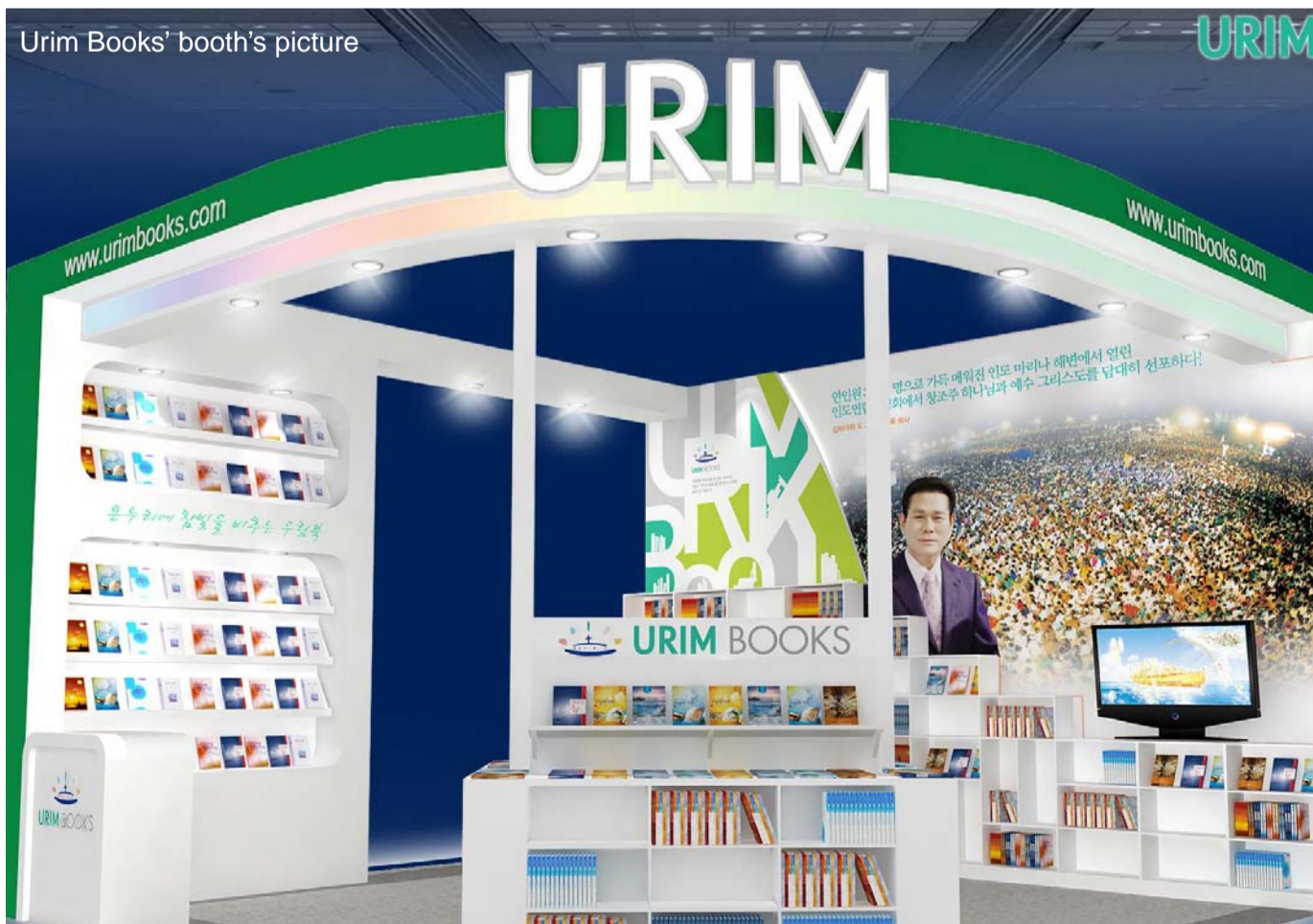
Urim Books' booth's picture