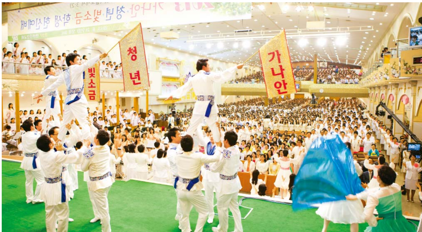
This united devotional service demonstrated the greatness of God's love and expectation towards young members who live in this end time and filled them with hope for Heaven and renewed vision. (Photos above, the devotees of the four missions are offering up special performance.)