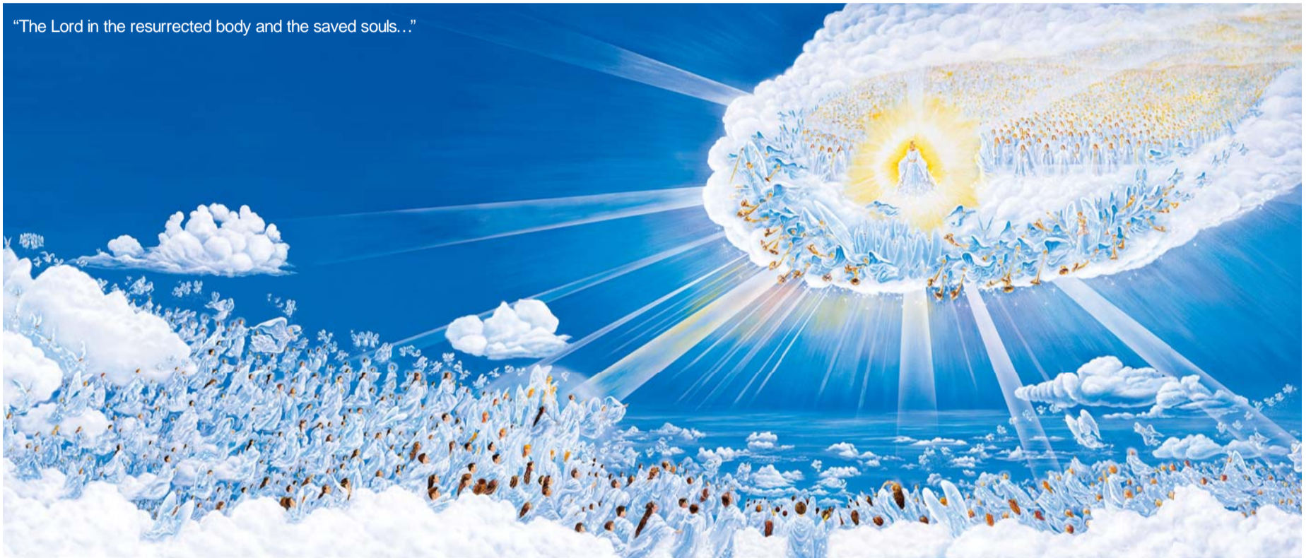
“The Lord in the resurrected body and the saved souls...”

All these are recorded in 1 Corinthians 15:51-53, “Behold, I tell you a mystery; we will not all sleep, but we will all be changed, in a moment, in the twinkling of an eye, at the last trumpet; for the trumpet will sound, and the dead will be raised imperishable, and we will be changed. For this perishable must put on the imperishable, and this mortal must put on immortality.”