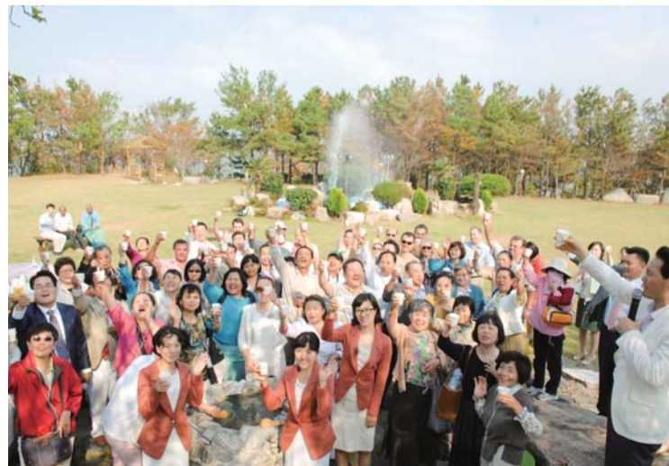
His visit to Muan Sweet Water Site where God’s power unfolded (Muan, Jeonnam Province)