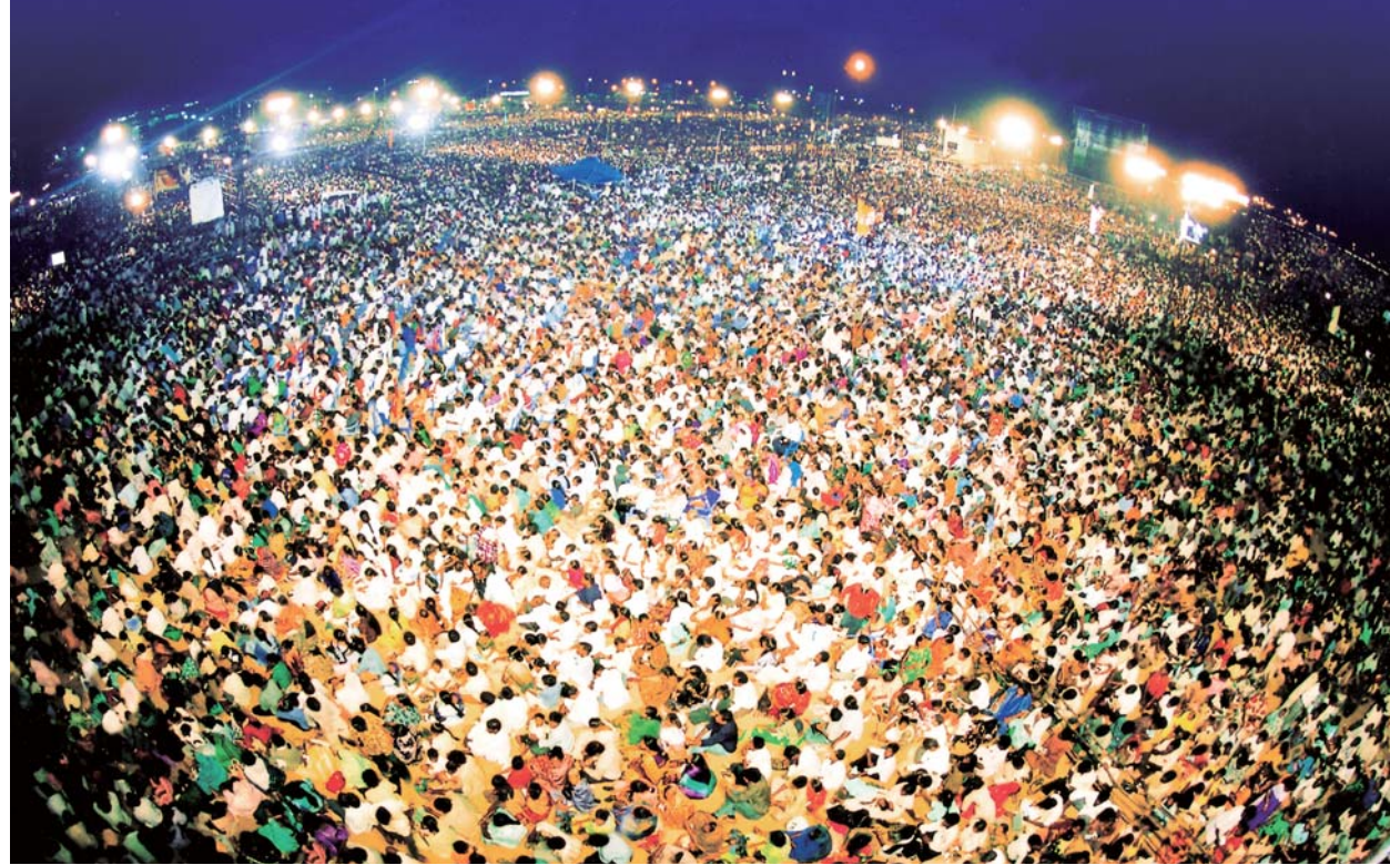
2001 Philippine United Crusade