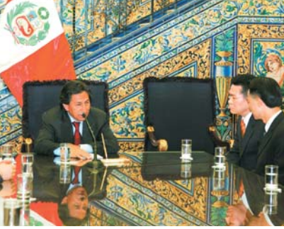
Conversation with the Peruvian President at Conversation with the President of DR Congo the time of the 2004 Peru Healing Crusade