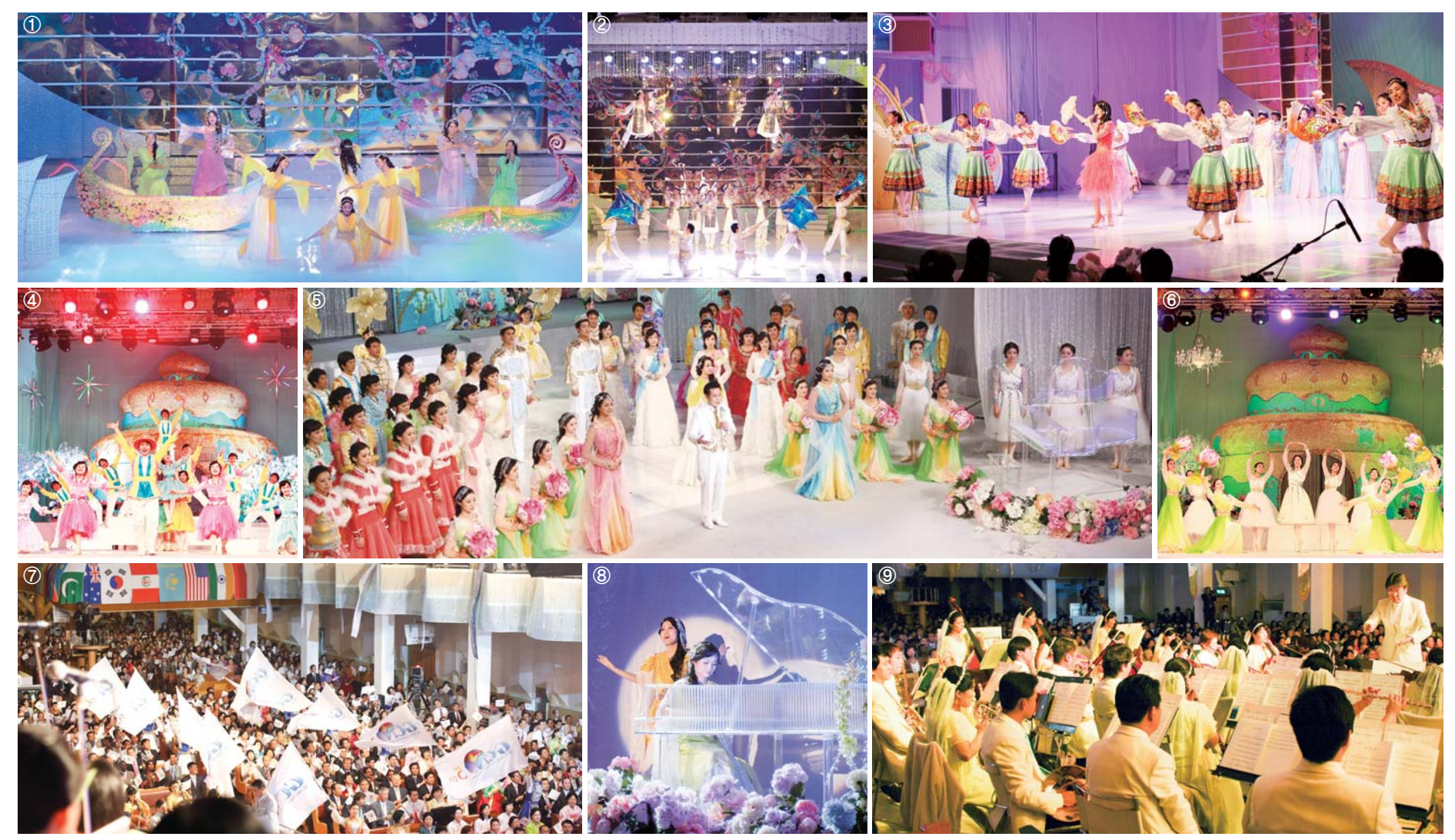
By presenting the archangel's praise, the amusement park in New Jerusalem, the banquet in the castle of the shepherd, and the like, Manmin's Anniversary Celebration Performances describe the beauty and wonder of Heaven. They have impressed audiences in ways we haven't seen anywhere else. People both in and out of Korea highly compliment songs sung in various languages, the beautiful costumes and wardrobe, the dance, and the orchestra and other instrumentals. People have higher hope for the performance year by year.

In Preparation for the 30<sup>th</sup> Church Anniversary Celebration Performance "Heaven and Earth"