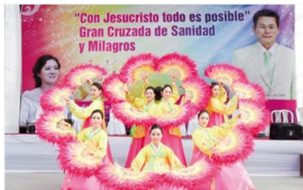
The performance of Power Worship Dance Team at the Handkerchief of Power Crusade in Carabayo