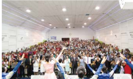
The praise time at the Pastors’ Seminar held in Peru Manmin Church