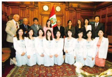
The mission team’s visit to National Assembly Building of Peru