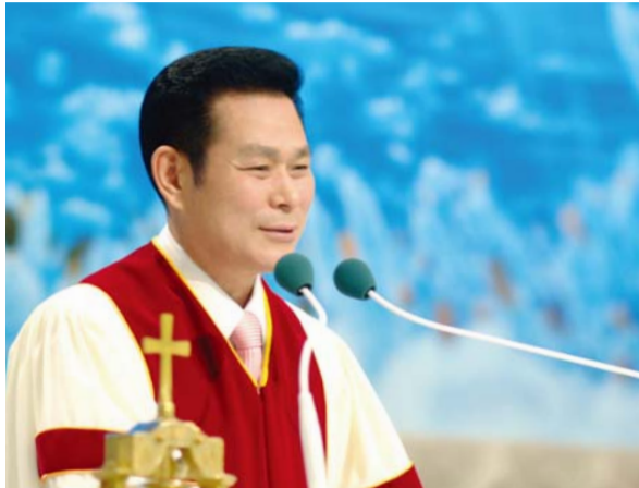
Senior Pastor Dr. Jaerock Lee

Jesus said in Matthew 19 that it is not right for a husband to divorce his wife because they are no longer