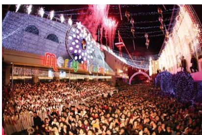
2011 Lighting Ceremony