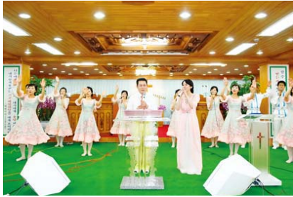
Mini Crusade in the second sanctuary of Manmin Central Church