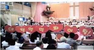
The members of Daejeon Manmin Church who came to Manmin Central Church to gave cheer to those members who participated in the final round of Manmin Bible Quiz Contest

As the Canaan Era is just ahead of us, the importance of Word-armed workers couldn't be more emphasized. This is Daejeon Manmin Church, a church that has set such an excellent example through obedience.