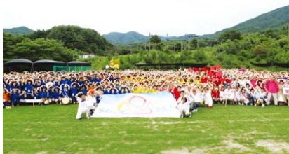
2011 Six-mission United Summer Retreat in Sungwo Resort in Hwaengseong, Gangwon