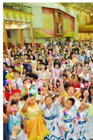
2011 Children's Summer