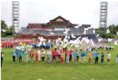
2011 Manmin Summer Retreat in Deokyusan Resort in Muju, Jeonbuk