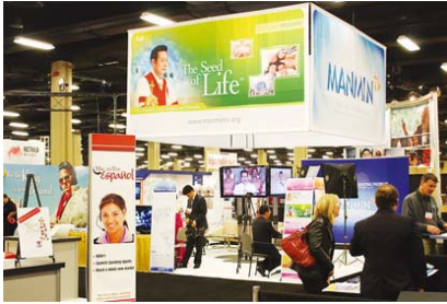
The 68th NRB (National Religious Broadcasters) Convention and Exposition in Nashville, Tennessee, US

During the year of 2011, God the Father allowed a number of members not only to receive salvation but also become men of spirit and whole spirit who glorify God in the rapid spiritual flow through the power, tears, and petition of the shepherd. Above all, He has offered them the original light of God to change even the hearts of men so that they could firmly lay financial and systemic foundation for the construction of Canaan Sanctuary that has the beauty of God.