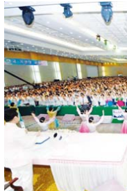
2011 Group Leaders