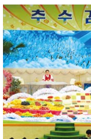
2011 Thanksgiving Sunday