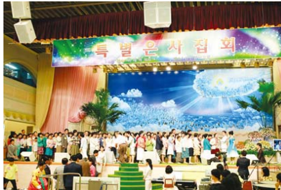
The Three-session Consecutive Special Divine Healing Meeting