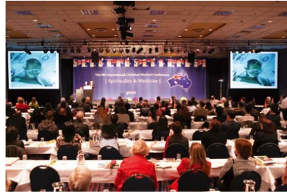
The 8th WCDN International Christian Medical Conference in Brisbane, Australia