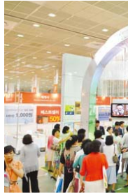
The 17th Seoul International Convention Hall in Samsong