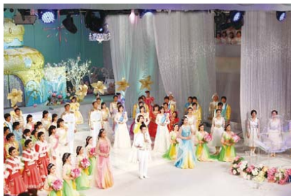
The 29th Anniversary Celebration Performance of Manmin Central Church