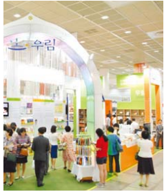
national Book Fair in Coex sung Dong