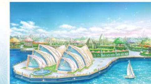
The performance hall surrounded by the jewel-like lake