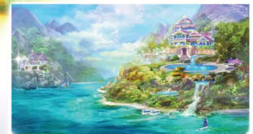
The beautiful villa for the most comfortable rest