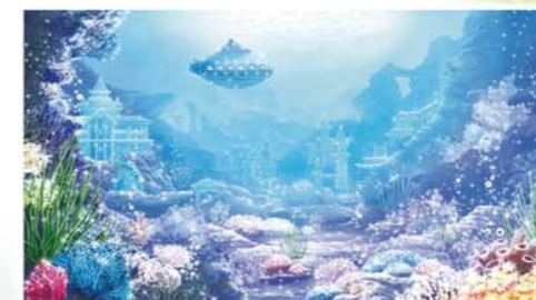
The rugby-ball-shaped submarine in the mysterious and amazing sea

★ The Pictures of the 3D Video Presentation 'New Jerusalem' in the 29th Anniversary Eve Event