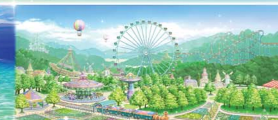
The amusement park that gives out beautiful lights