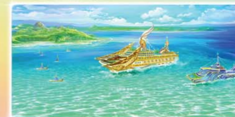
The gorgeous cruise ship and crystal ship on the vast sea