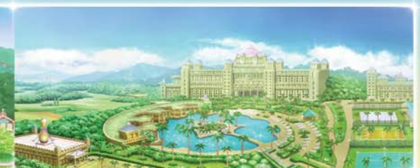
The heavenly resort equipped with all kinds of sport and leisure facilities