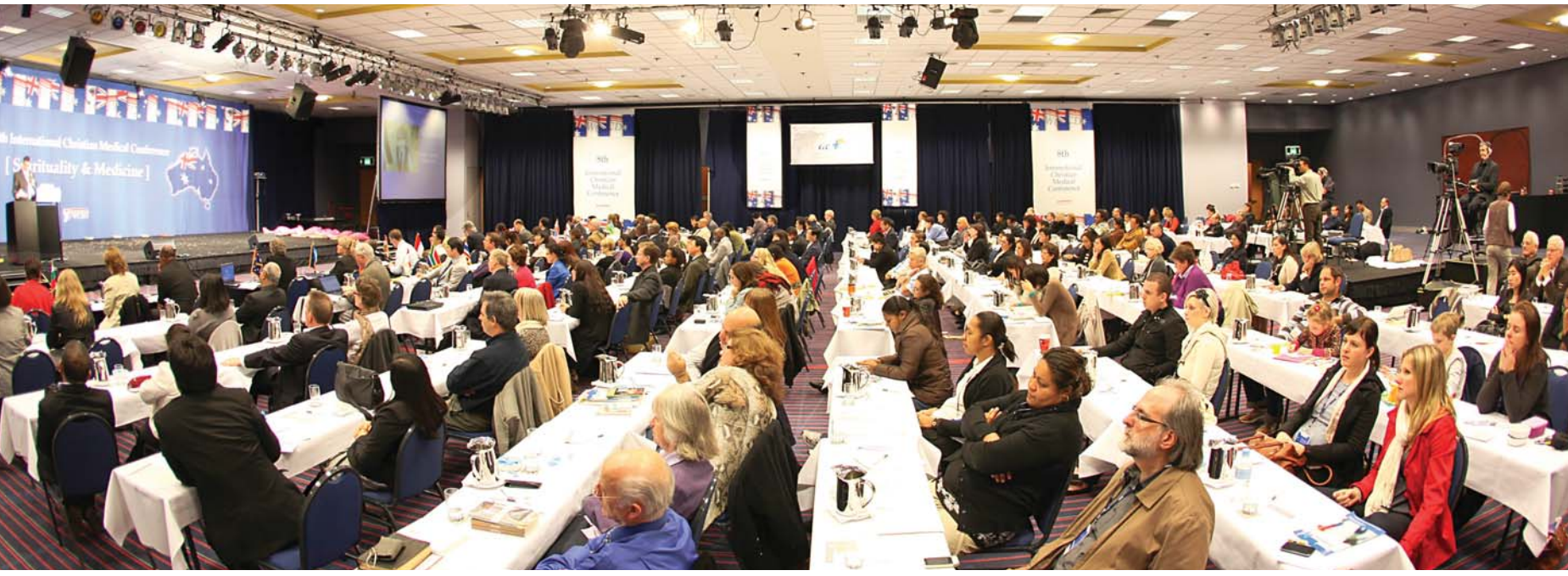
In the 8th International Christian Medical Conference, doctors in attendance were listening carefully to the divine healing cases that proved the power of God. They gave glory to God with rousing applause after each presentation. (Brisbane Convention & Exhibition Center, Australia)

The 8<sup>th</sup> International Christian Medical Conference was Held in Australia with Doctors from 27 Countries Attending