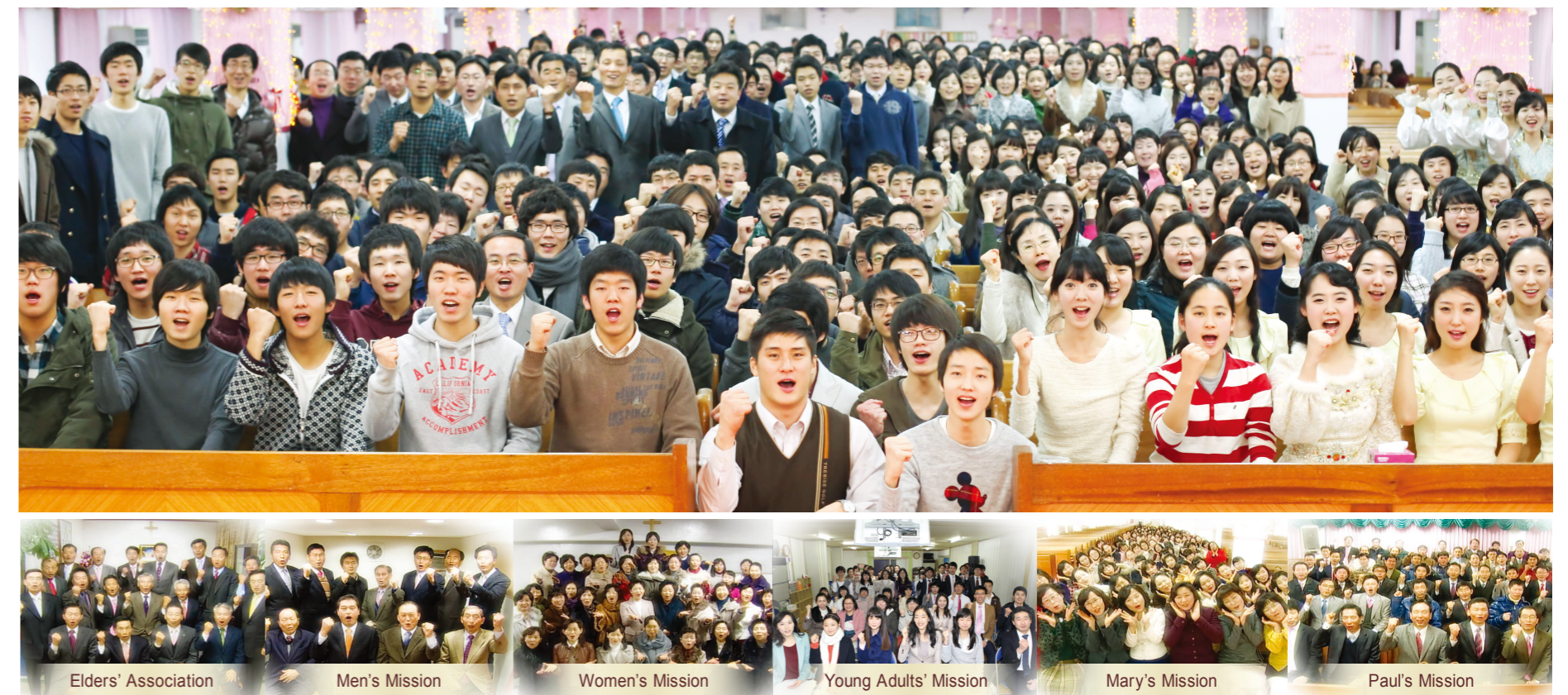
College Mission determined to become a true Christian without compromising with the world and is performing a campaign “Let’s Enter New Jerusalem” and then many church members are participating in this campaign including Elders’ Association, Senior Deaconesses’ Association, Men’s Mission, Women’s Mission, Paul’s Mission, Mary’s Mission, Young Adults’ Mission and Canaan Mission.

“Spiritual Restoration’ Campaign Is Being Performed toward the Goal of Entering New Jerusalem