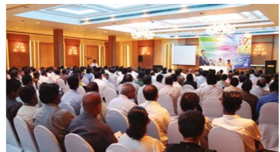
Sri Lankan Pastors' Seminar held at the Ramada Hotel in Colombo, Sri Lanka