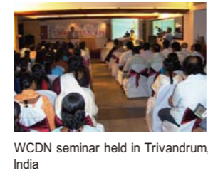
WCDN seminar held in Trivandrum, India

Medical Conference held in Chennai, India in May, 2005, about 500 medical doctors from 11 countries participated and made presentations covering the cases of healing by the power of God and proved them medically. Since then, WCDN continued its ministry in India strengthening the evangelization of India. Seminars were held in Nagercoil and Tiruchirappalli of Tamil Nadu State, Hyderabad of Andhra Pradesh State, Trivandrum and Karakonam Medical College of Kerala State. In addition, they have preparatory meetings for seminars in New Delhi, the capital city, and they are awakening many medical doctors, scholars and others of the academia world with the power of God and the holiness gospel.