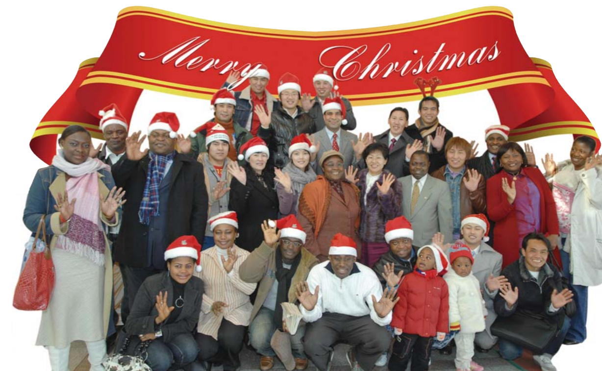
Members of Foreign Parish celebrating Christmas after the service