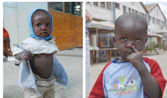
Before receiving prayer, and 3 weeks after receiving prayer