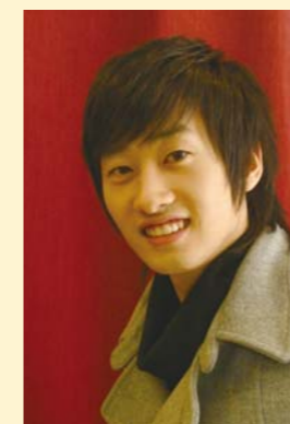
Hyukjae Lee (Singer, member of popular group 'Super Junior')