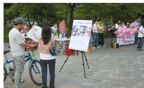
The Young Adults' Mission participating in street evangelism on "Literary Mission Day"