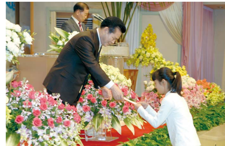
The Fourth Quarter Scholarship-awarding Ceremony was held at the main sanctuary during Sunday evening service on November 8, 2009.