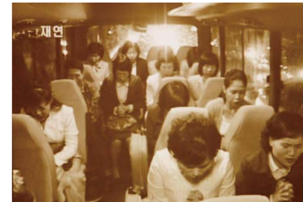
On the left is an early picture of the Salt and Light Mission group as they worshipped in the church bus. Now, after 24 years, they are offering worship in their own sanctuary located in Daechi-Dong, Gangnam-Gu, Seoul (Taken during the 24th anniversary service of the Salt and Light Mission on October 24, 2009).