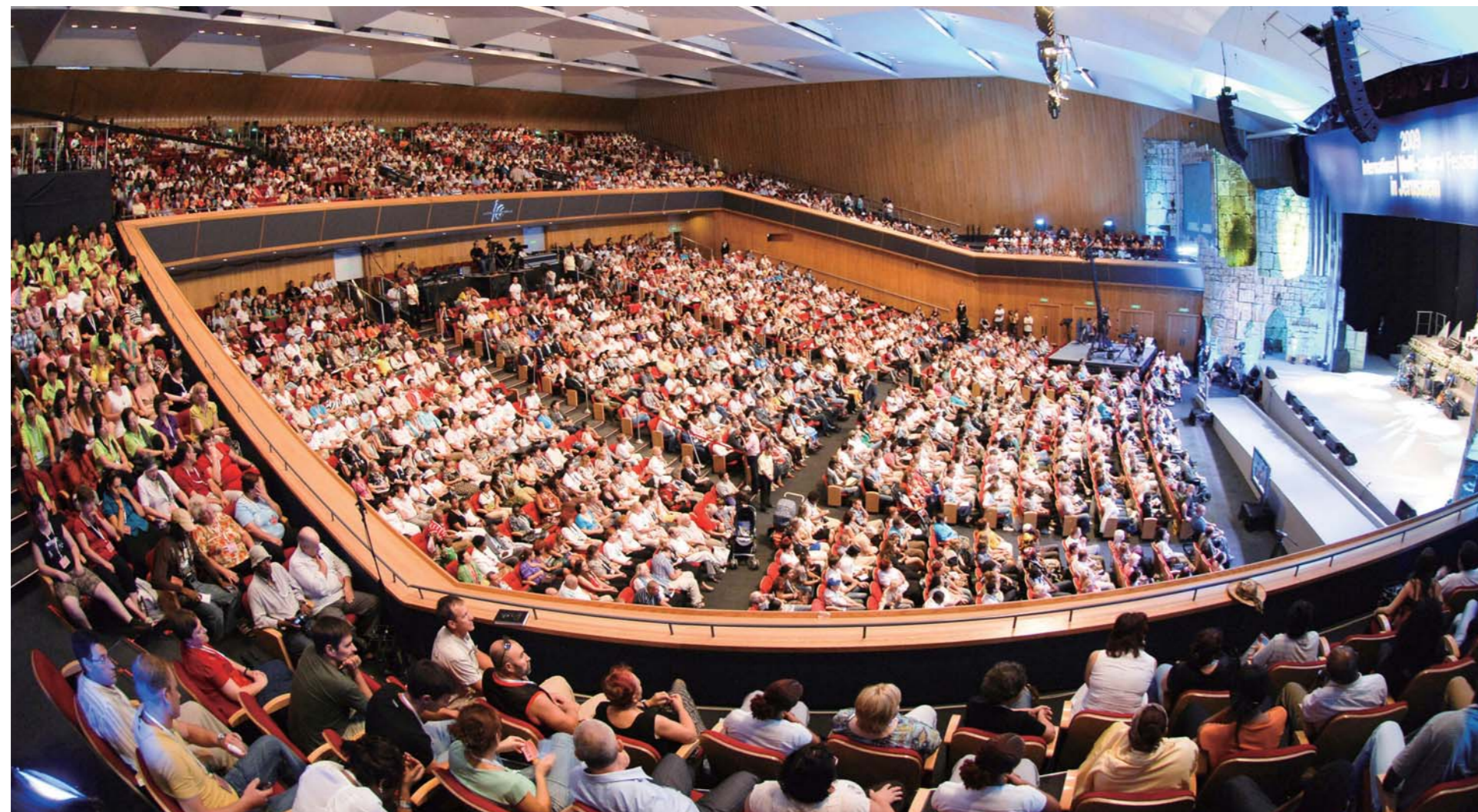
Visitors from 36 countries around the world concentrating on Dr. Jaerock Lee's message at the 2009 Multi-Cultural Festival held in ICC (The International Convention Center) in Jerusalem, at the heart of Israel