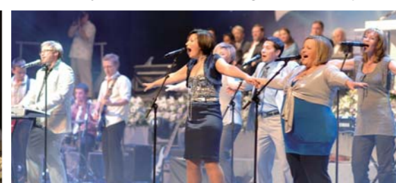
Israeli praise team