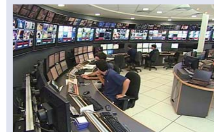
Connected to 220 Television Stations and Broadcast to 220 Nations around the World through RRSat (Global Communications Network)