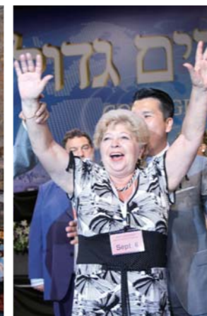
Woman deeply moved after being healed of neck pain