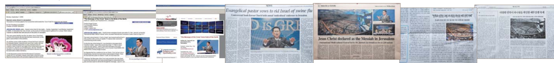
The 2009 Israel United Crusade was covered by leading media groups