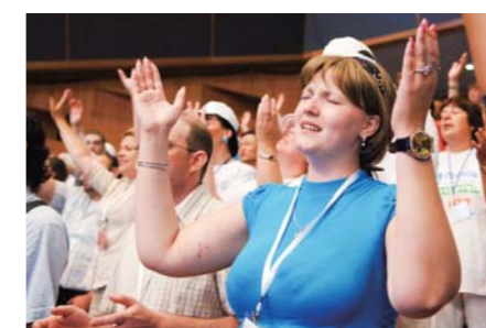
Audience Praising God

phone, he notified his acquaintance who was at the festival, that he was able to begin moving his leg, which he couldn't move for a week.