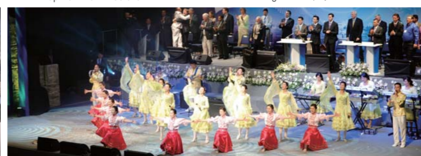
Performance team praising God in five languages: English, French, Russian, Hebrew and Lingala