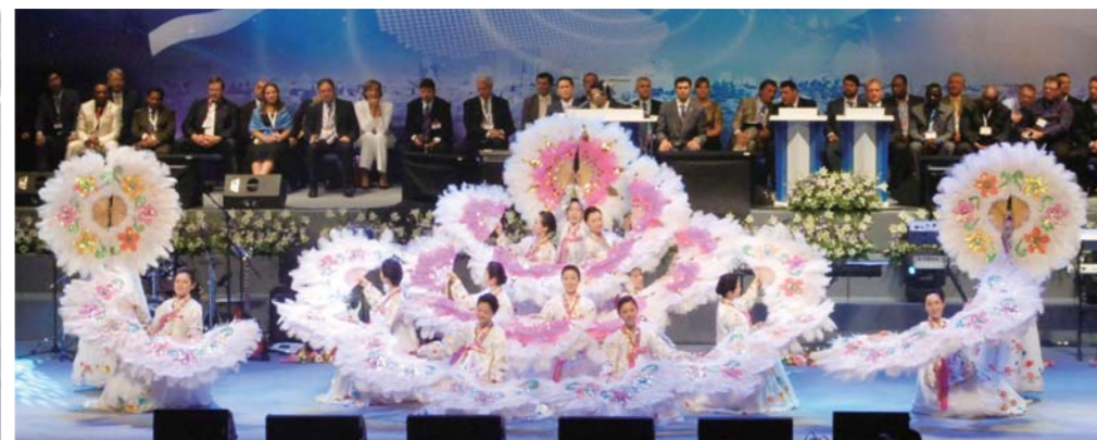
Performing fan dance to the song 'Jerusalem of Gold'